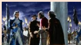
General Berthier taking Pope Captive

Answer: Revelation 13:10 reads, “ He who leads into captivity shall go into captivity; he who kills with the sword must be killed with the sword ” (NKJV). According to Jeremiah 15:2 and 43:11, similar language as this describes God’s judgment in which He uses a military force. Of course, the Papacy is an institutional power. Since it would be redundant to say that such a power will be figuratively killed and taken captive, logic suggests that it means that its head, the Pope, would be literally captured at the same time the Papacy as an institution will be figuratively killed (or nearly killed).