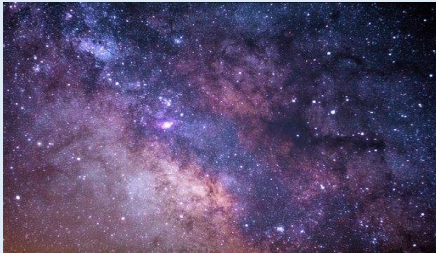
Starry Night Sky