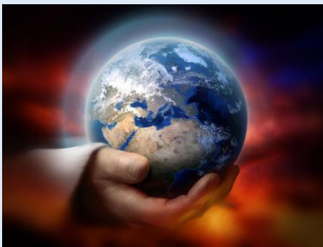
God holding the Earth in His hands